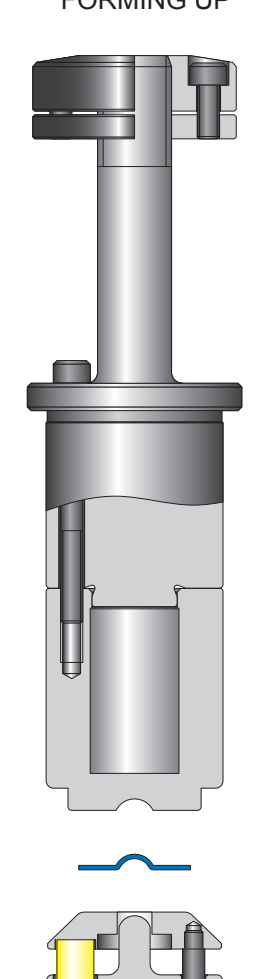
TOOLING STRUCTURE (NC 1-1/4) FORMING UP

Used for strengthening, nonslip or decoration.