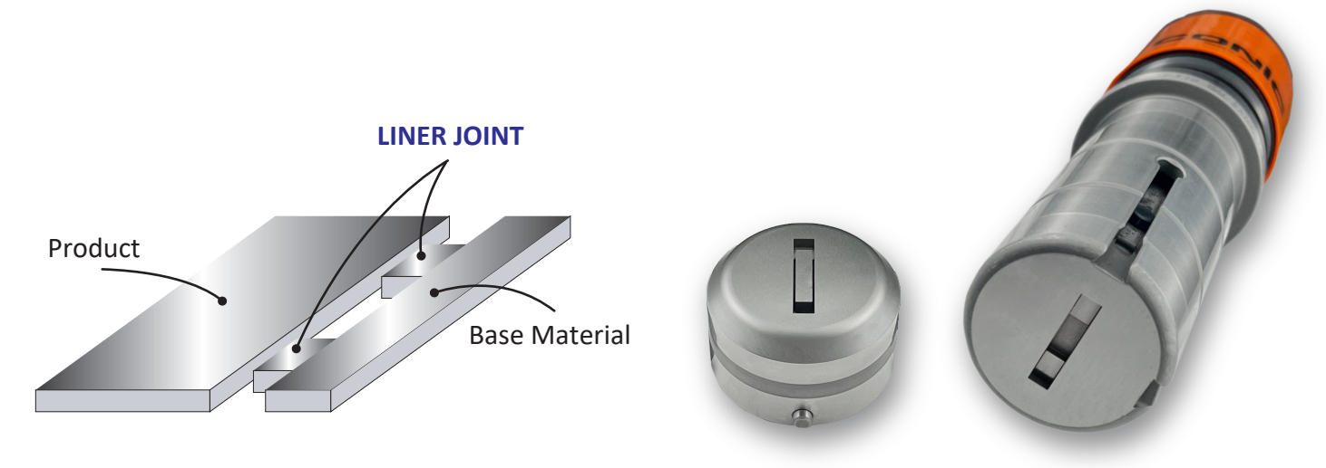
LINER JOINT TOOL (e.g. NC 1-1/4" width: 5mm)

By connecting the base material and the product with a half-cut joint, this tool can further reduce the appearance of joints and protruding remnants that occur with micro-joints and wire joints. The width and number of joints adjust the holding power of the product.