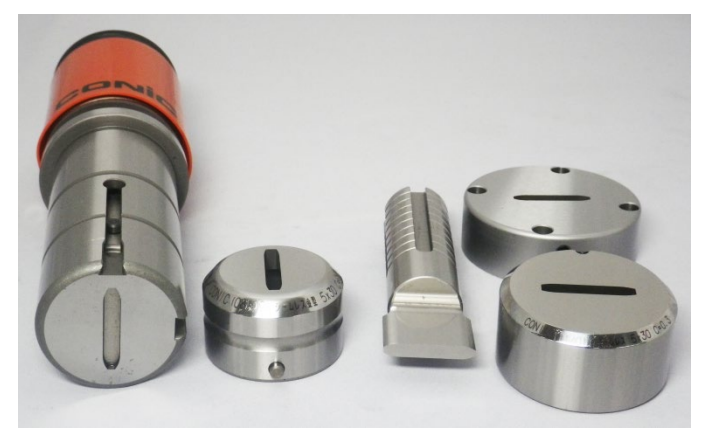
Amada long type Murata Vulcan type SEAMLESS TOOLS