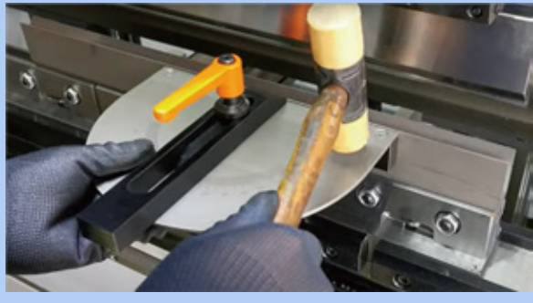
2. Use a plastic hammer to adjust the position of the front table of the main unit and the top surface of the die so that they are aligned.