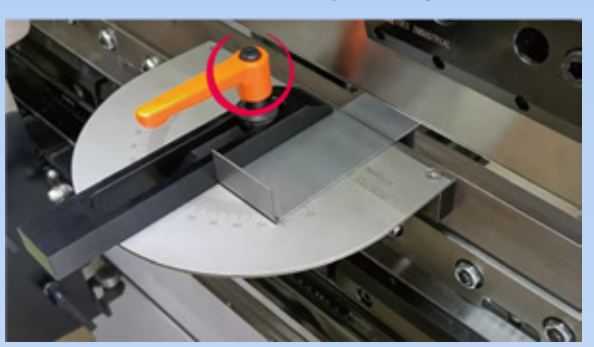
*If the clamp lever interferes with the punch or brake, it can be changed to any position by pulling up and turning the lever.