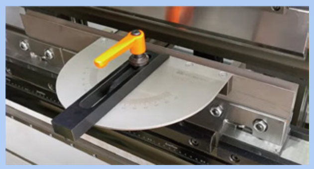
1. Attach the die to the body with a magnet.

For safety reasons, please turn off the power to the machine before attaching or detaching the angle guide.