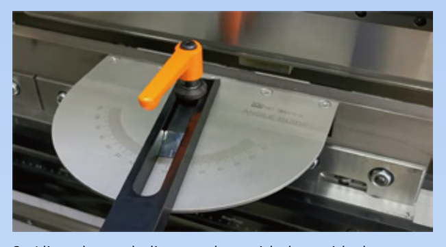
3. Align the scale line on the guide bar with the desired angle and start machining by placing the workpiece against the guide bar.