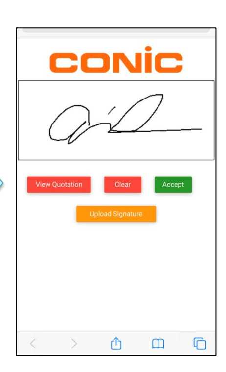
Next time, we will explain the system for dealer. Look forward to it!!!