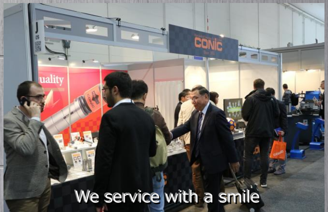
We service with a smile

Contact us: CONIC Co., Ltd TEL:+81 72 966 9898 osaka_fa@conic.co.jp