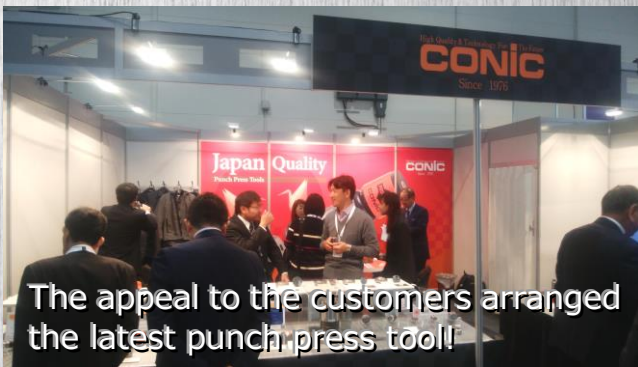
The appeal to the customers arranged the latest punch press tool!

This time becomes seventh time of exhibitors, we have many people overseas dealers to meet every time.