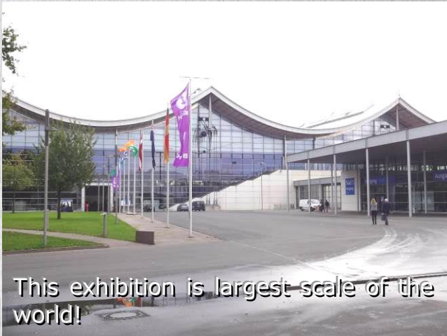
This exhibition is largest scale of the world!

The EuroBLECH 2018, the 25th international sheet metal working technology exhibition is held in Hanover, Germany from Oct 23 st to 26 th . We displayed total weight exceeding 300kg tooling at there.