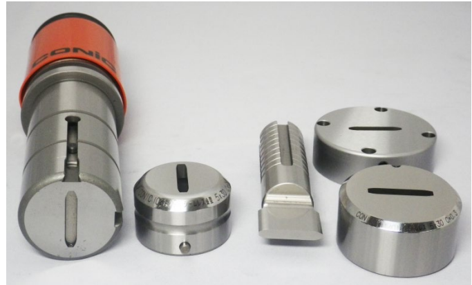
Amada long type