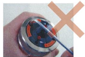
Similar tools of other companies need adjustment using a hexagonal wrench.

The height can be adjusted just in a few second. Furthermore, no tools such as hexagonal wrench are required to attach and detach the parts for tool maintenance. With 1/4 the time of our standard tool, anyone can perform safe, accurate and speedy maintenance.